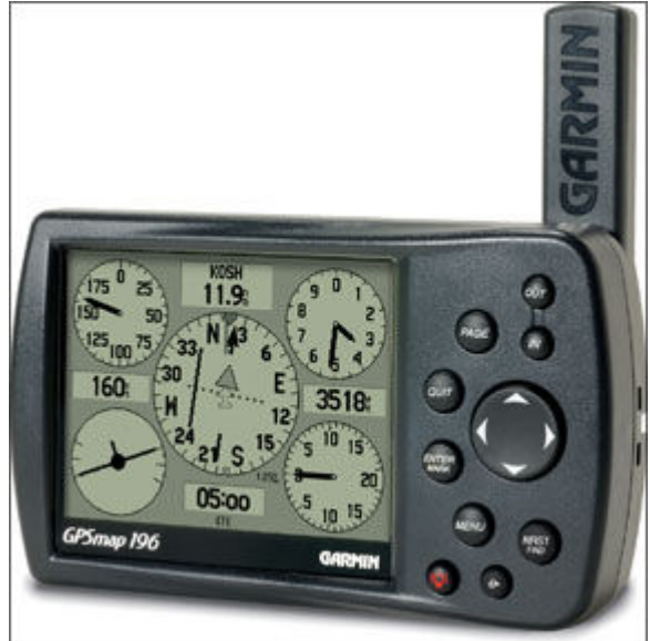
Garmin's monochrome GPSMAP196 was the first GPS navigator to offer the company's virtual instrument panel.

These portable units are not certified for use under IFR for several good reasons. First, there is no standard way to mount them in