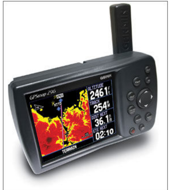
The GPSMAP296 upped the ante by exchanging the 196's screen for one displaying 256 colors.

As with any other act of instrument flying, when contemplating using one of these Garmin portable GPS devices for an emergency bailout maneuver, it is wise to have a strategy and prepare. Think about your scan and practice in your airplane in visual conditions with a trusted safety pilot.